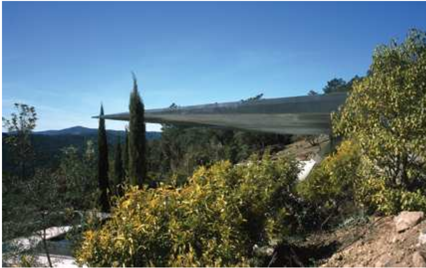
Figure 1 Villa Navarra Philipp Rualt

partnership policy with the construction industry, designers, consultants and architects. This resulted in very unique concrete structural designs; one example being the famous villa Navarra with its roof made from Ductal (see fig. 1 below).