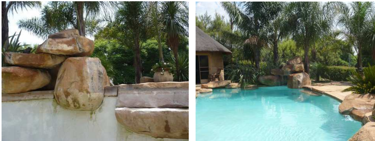
Figure 3 Special application of CemForce for niche market applications

The first applications using Polypropylene nets in fibre reinforced cements were investigated by Hibbert and Hannant (2). This product demonstrated the useful impact properties which could be derived from placing continuous Polypropylene nets in corrugated sheets. Textile reinforced cements developed over the last decades and much research was done at the University of Aachen and Dresden amongst others. In South Africa Don Hourane (3), an inventor used unique applications of woven textiles (CemForce) For example in certain built-up areas where access for large trucks is limited, the innovative ideas for making “rocks” out of textile fabrics for swimming pools or features in back gardens, a unique example of necessity being the mother of invention. Here chicken wire is used to create the shape of the rock or feature and CemForce was then placed on top of this. The cement/sand mixture was brushed into the woven mat. The required thickness is achieved by using a multiple layered technique with the matrix applied by hand. Obviously this type of application is intended for niche market applications with unique characteristics. See Figure 3 below